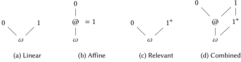
Fig. 2. Hasse diagrams for various substructural type system lattices. The modality @ corresponds to 0 or 1 uses, 1^+ corresponds to 1 use or more, \omega corresponds to any number of uses.