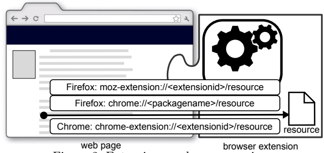
Figure 2: Extension - webpage overview

If webpages are forced into behavioral extension detection, they cannot easily determine which extension is caus-