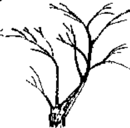
After Second Years Pruning