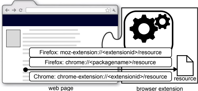
Figure 2: Extension - webpage overview

If webpages are forced into behavioral extension detection, they cannot easily determine which extension is caus-