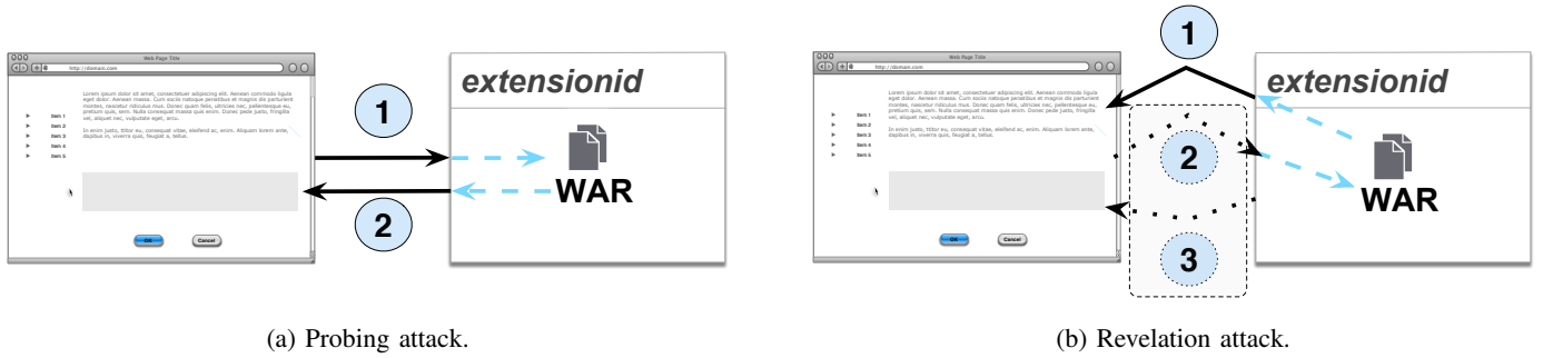
Fig. 1: Schematic overview of the extension probing attack and extension revelation attacks. In the probing attack, a web page probes for the presence of an extension. In the revelation attack, the extension reveals itself to the attacker by injecting content in the web page.

many or even all installed browser extensions.